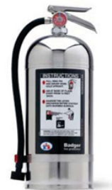
Class K Extinguisher

References: 2007 Oregon Fire Code Chapters 9 and 24